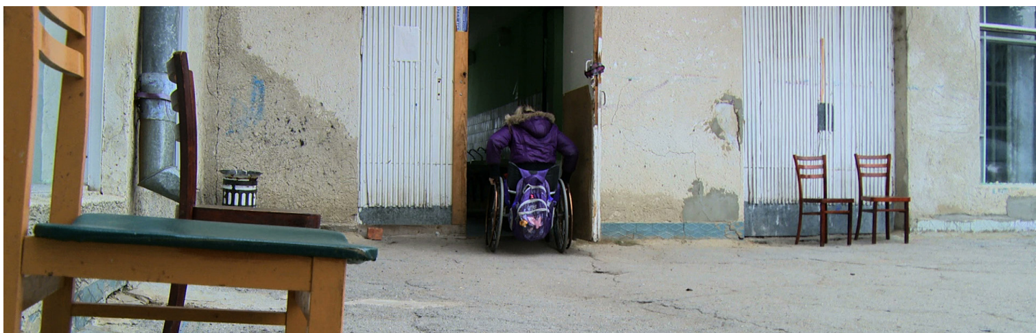
THOMSON FOUNDATION/HROMADSKJE DISPLACED PROJECT

indicators is not especially complex. The monitoring data gathered during a monitoring exercise are descriptive rather than inferential. This means that analysis only addresses the actual broadcasts that have been monitored and does not attempt to predict the characteristics of other broadcasts that have not been monitored (by techniques such as regression analysis).