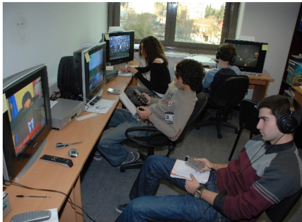
Images (above): Media monitors conduct quantitative analysis of television